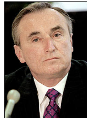
Chief William Bratton

Bratton has a great reputation and a record of success, but there is little doubt that he now faces the greatest challenge of his career. If his "Turnaround" is successful in Los Angeles he will etch his reputation as a great police leader in stone. If he fails, his critics' claim that his previous successes had more to do with luck and timing than anything else may gain some credibility. Expectations are high and the world is watching.